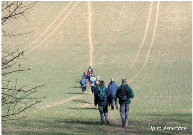
Up to Asheridge

To the west of Chesham are a number of parallel valleys which offer delightful views of the rolling Chiltern countryside. Along the valleys run tracks with curious names such as Herbert’s Hole and Blind Lane and roads that on some days are almost devoid of traffic. This walk goes out on one such track and then cuts across the valleys climbing to the top and then descending to the bottom. It returns through Chesham’s backdoor, Lowndes Park, and while crossing it the view of the town nestling in a hollow slowly comes into sight. The total length of the walk is 8 miles (13 km) but it can be shortened in various places. On route there is the opportunity to see the remains of an iron-age fort and to pass a house that was built in two parts, one either side of the road.