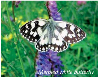
Marbled white butterfly

Chesham Walkers are Welcome launched the following walking routes in 2008 and they would welcome your comments.