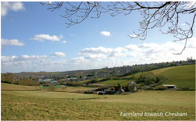
Farmland towards Chesham