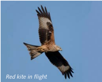
Red kite in flight